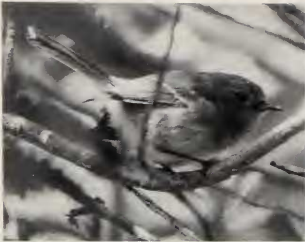
FIG. 3. Juvenile Kaua'i 'Elepaio.

cies, this cosmopolitan species may be a post-Polynesian colonizer of the Hawaiian Islands (Olson and James 1991).